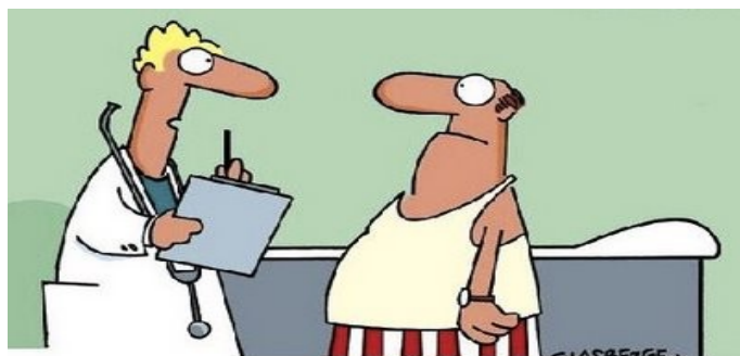
"What fits your busy schedule better, exercising one hour a day or being dead 24 hours a day?"

Last November, the City Council approved to hire a local contractor to redesign and host the City's website. The sight has a completely different look to it, but still has the all the newest updates from the city. By the time you receive this, we should have the link up so that you can add the new "Winfield App" to your smart phone. If there should be an emergency, water issue or a special event is taking place, we will be able to get this information out to our residents quickly and safely. This is just another way we are trying to keep Winfield informed. f